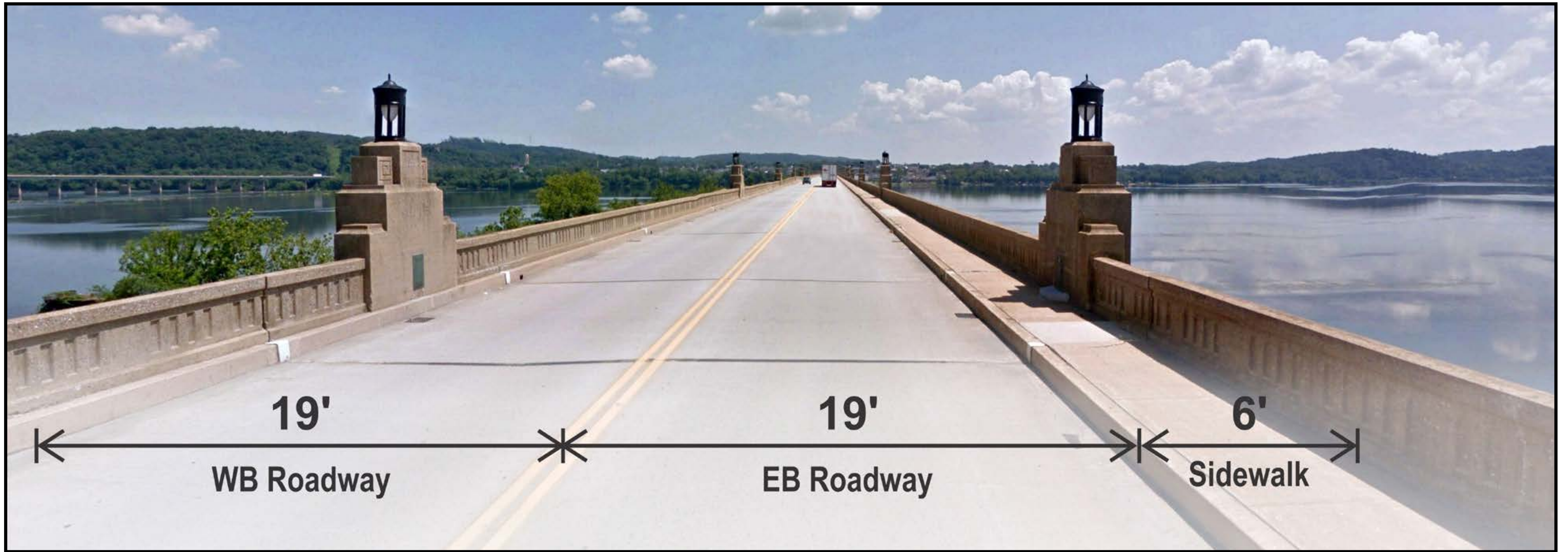
EXISTING ROADWAY SECTION NEAR WESTERN APPROACH (LOOKING EAST TOWARDS COLUMBIA)