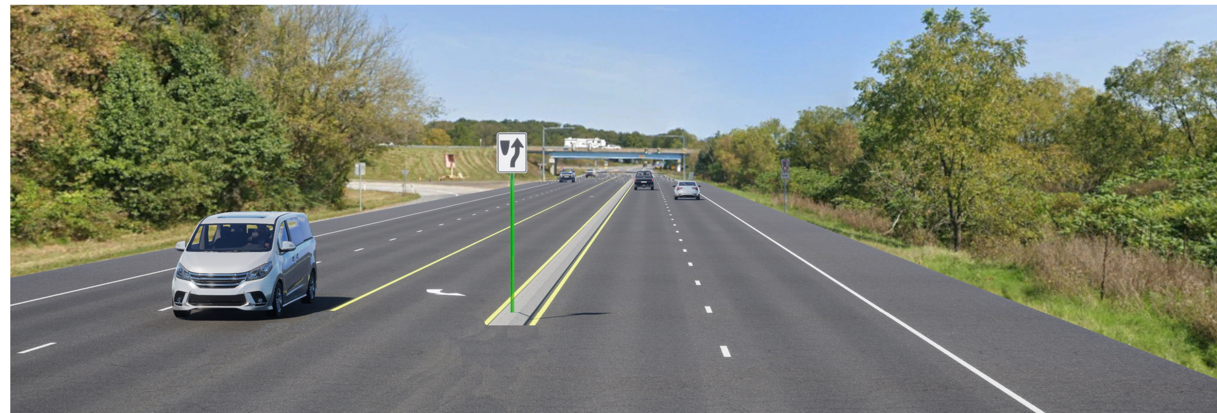
Rendering of Urban Roadway Typical Section

PA 45 in Harris Township from Boal Avenue to proposed SPUI Interchange