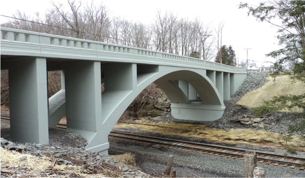
SR 4005 in Lackawanna County after Rehabilitation