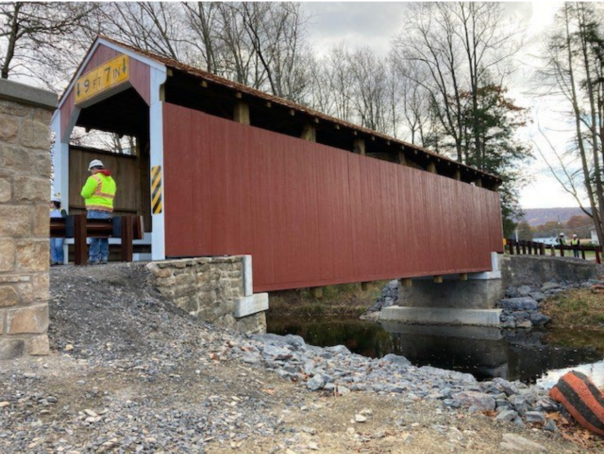
Zimmerman Bridge after Rehabilitation