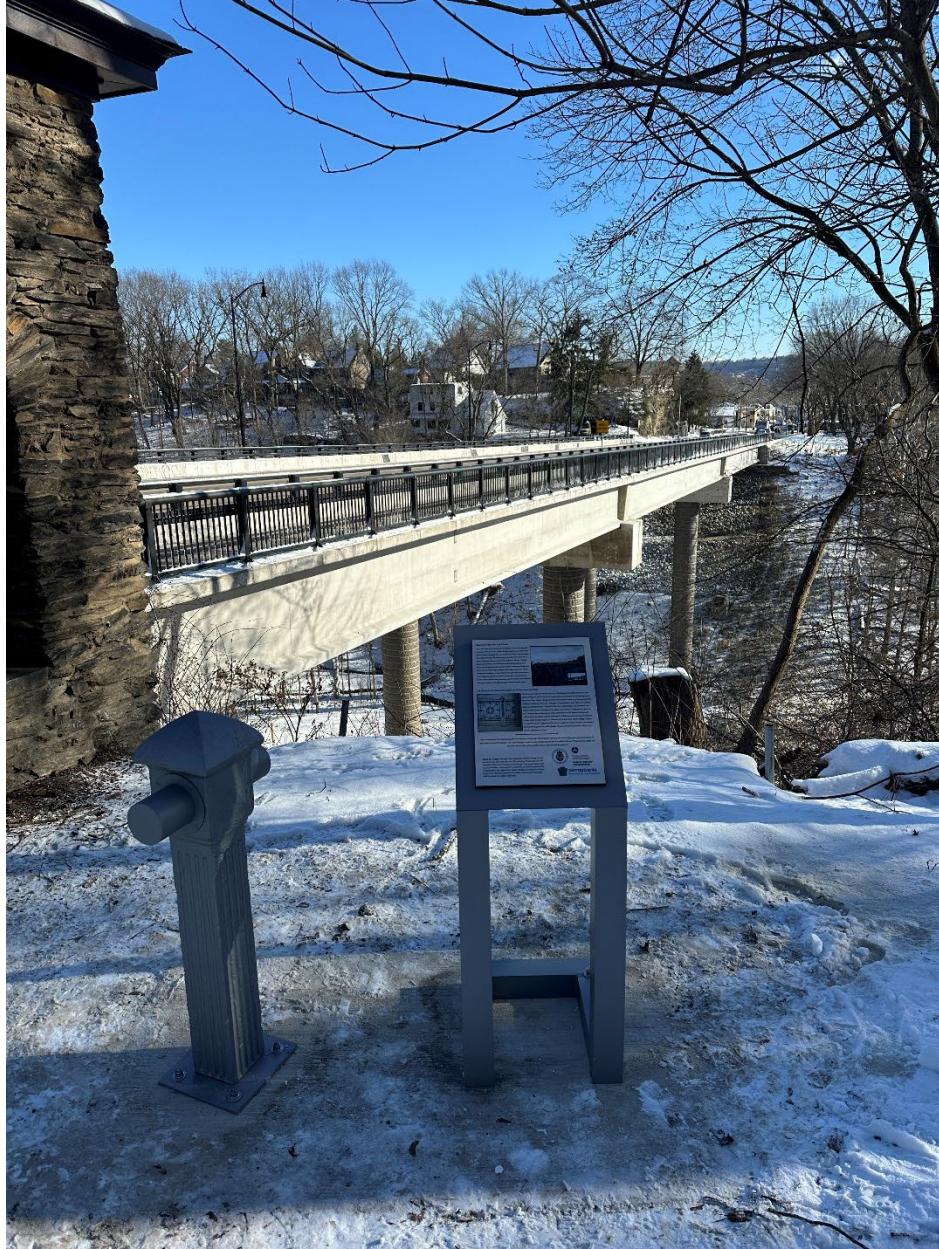
Fern Hollow Bridge in background with plaque and earlier bridge part in foreground.

Machine Shop, the Excelsior Pottery Works, Vesuvius Manufacturing), and the Rice Landing National Bank. Many of the buildings associated with this booming period between 1810 and the 1930s still remain, including the W. A. Young Machine Shop, Excelsior pottery, Dilworth Mining Complex, Monongahela River Lock #6, the Art Deco bank, brick jail, and a series of vernacular clapboarded Victorian dwellings. PennDOT's archaeological and historical investigations were concentrated on the area around the SR 1010 bridge over Pumpkin Run, or rather two bridges crossing under Route 1010 and the National Register of